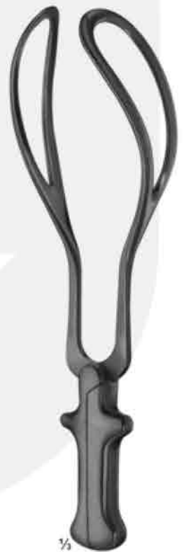
13-102 NAEGELE 400 mm