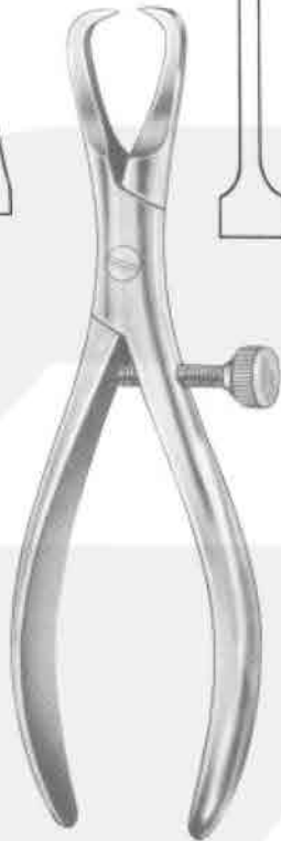
2283 Crown Removing Plier 14 cm