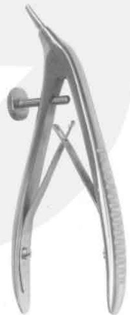
2289 Telescope Crown Plier, Fine 15.0 cm