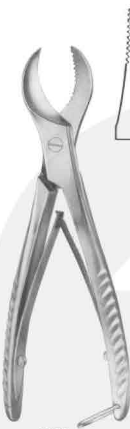
2282 Plaster Shear 210 mm