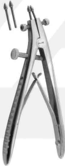
2287 Telescope Crown Plier, Diamond coated 13.0 cm