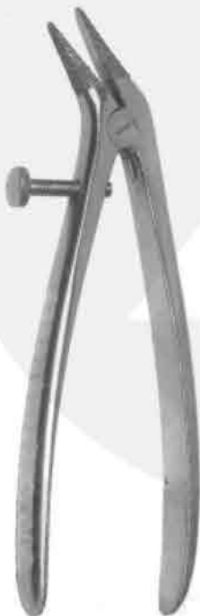
2286 Telescope Crown Plier, Diamond coated 13.0 cm