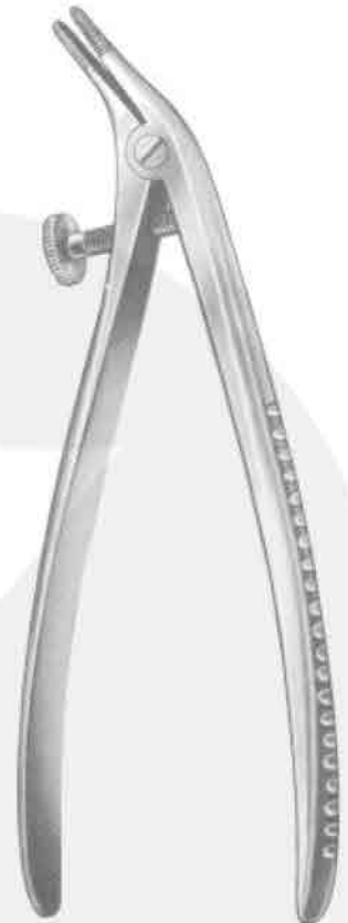
2285 BOHM 16 cm