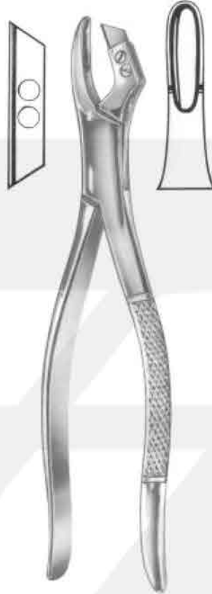
2284 MONTFORT 18 cm