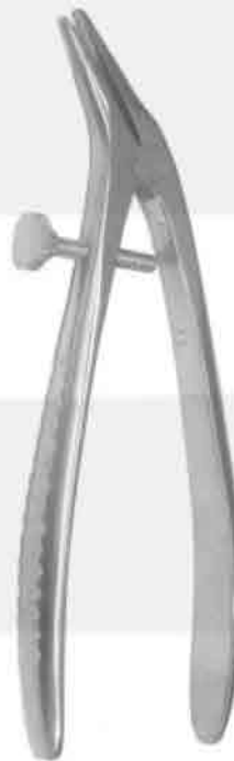
2288 Telescope Crown Plier 13.0 cm gerieften Maul 15.0 cm gerieften Maul 13.0 cm gelatts Maul 15.0 cm gelatts Maul