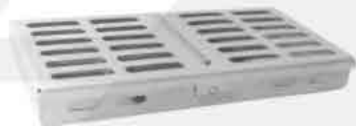
2949-A Instruments Tray of 10 Pcs