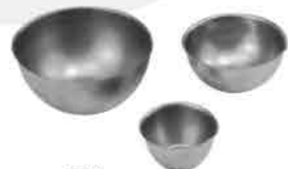
3003 Lotion Bowl With Lip 40-60-80-100-120-150-180-200mm