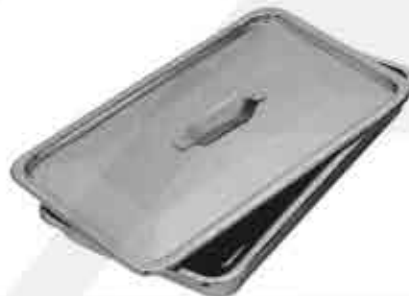
2971 Instruments Tray