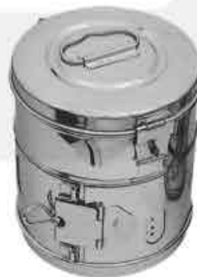
2963 Sterilizing Drum 280x240mm 230x150mm 300x250mm 340x160mm 350x250mm 390x200mm 380x300mm 100x100mm 150x120mm