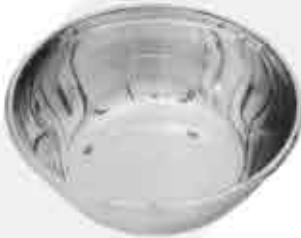
2991 Sponge Bowl