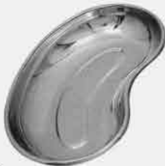
2995 Kidney Tray Shallow 150mm-200mm-240mm-300mm