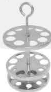
3001 Tube Rack, Round Model Stainless Steel 18/10