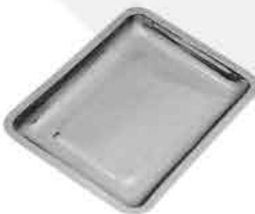
2973 Instruments Tray Shallow(Mayo)