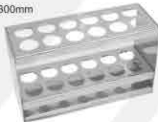
2998 Tube Rack, Stainless Steel 18/10