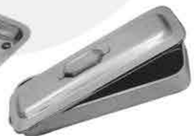
2976 Scalers Tray