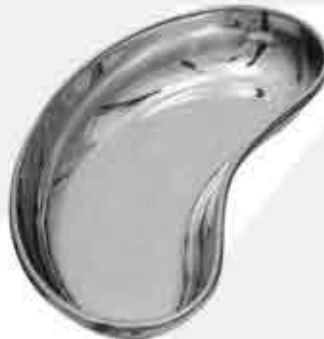
2996 Kidney Tray Without Lid 150mm-200mm-250mm-300mm