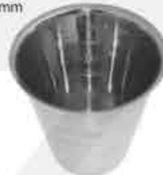
2993 Medicine Cup