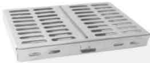
2948 Instruments Tray of 20 Pcs