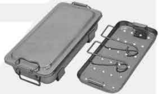
2969 Sterilizing Box 320x120 mm