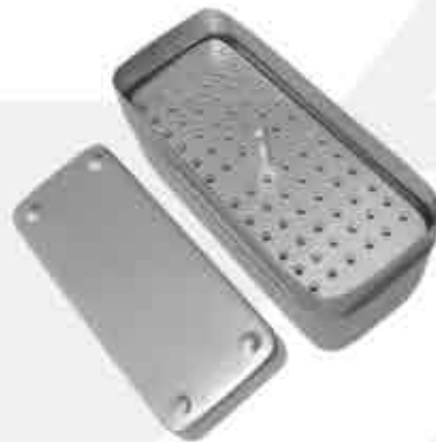
2968 Endodontic Box