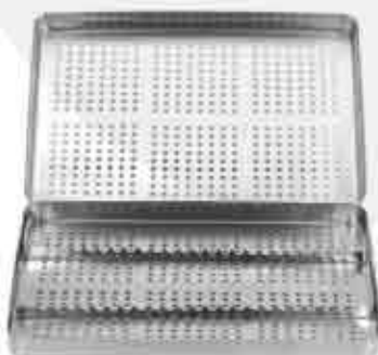
2954 Instruments Tray Perforated