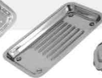
2975 Scalers Tray