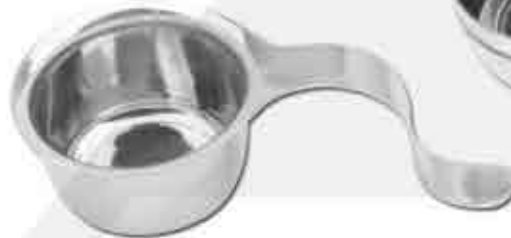
2960 Finger Cup