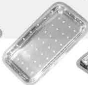
2974 Scaler Tray 20.0 x 10.0 x 1.5 cm