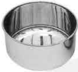
2989 Sponge Bowl