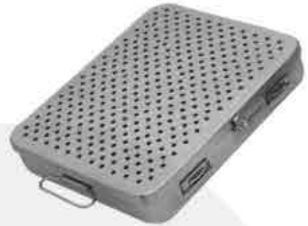
2966 Instruments Box