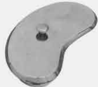
2997 Kidney Tray With Lid 150mm-200mm-250mm-300mm