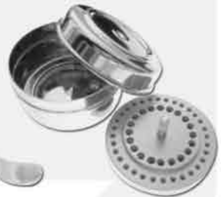
2961 Bur Box