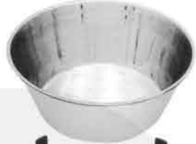
2994 Kick Bucket With Trolley