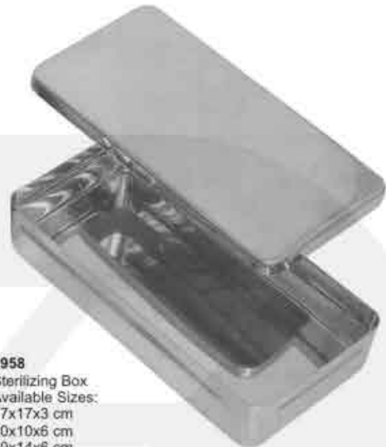
2958 Sterilizing Box Available Sizes: 17x17x3 cm 20x10x6 cm 30x14x6 cm