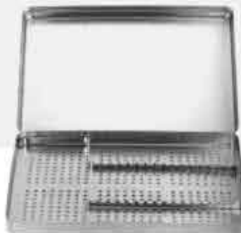
2955 Instruments Tray Perforated Base