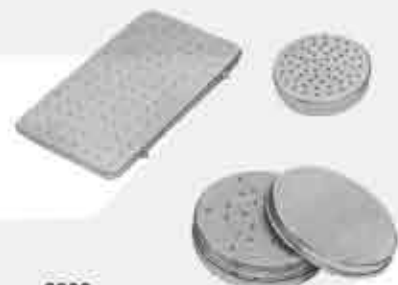
2999 Needle Case Rectangle Needle Case Round With Cover 90x15