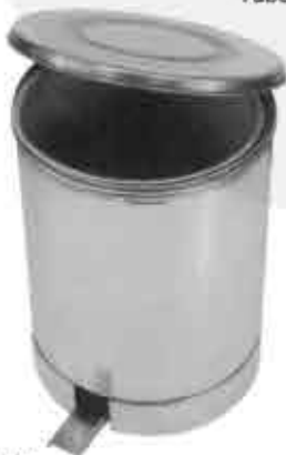
3000 Dustbin Without Stand 6-10-12 Ltr