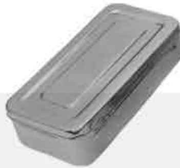
2965 Instruments Box