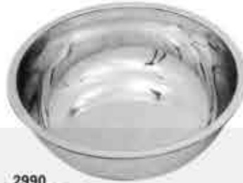
2990 Wash Basin 300mm-350mm-400mm