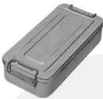
2964 Instruments Box