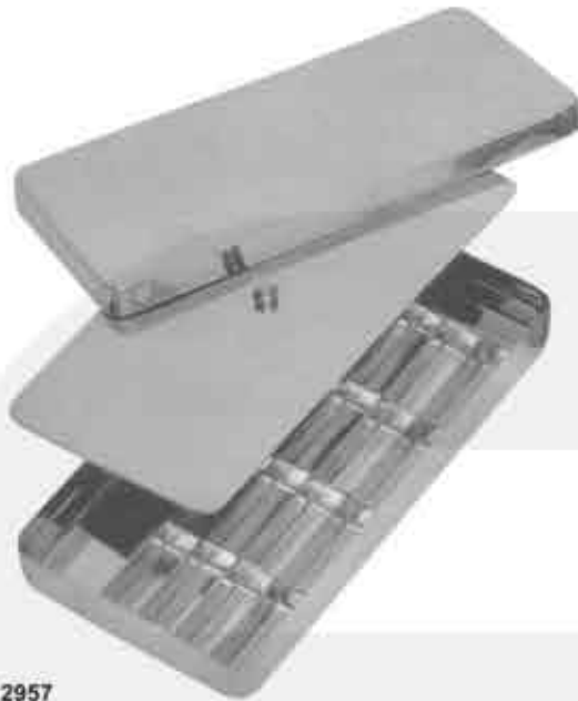
2957 Pulpectomy Tray