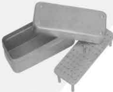
2959 Endo Tray Box