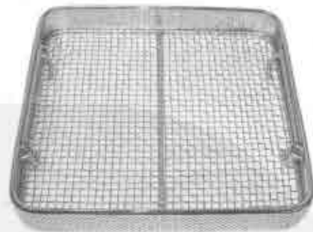
2951 Instruments Riddle