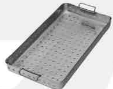
2972 Instruments Tray (Perforated)