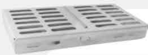
2949 Instruments Tray of 7 Pcs