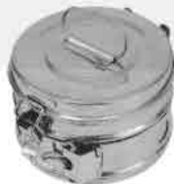
2962 Sterilizing Drum 150x150mm 175x175mm 190x190mm 200x140mm 200x200mm 240x120mm 225x225mm 240x240mm 290x160mm