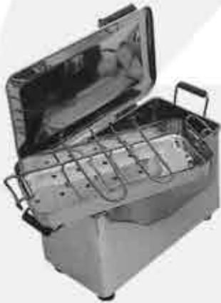
2967 Instruments Sterilizer 150x75 mm