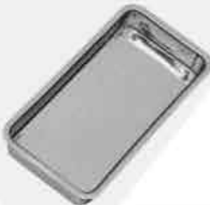
2970 Instruments Tray