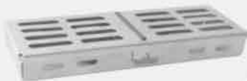
2950 Instruments Tray of 5 Pcs