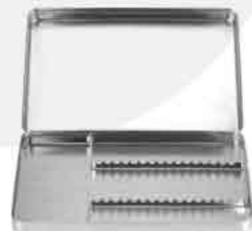
2956 Instruments Tray Solid Base